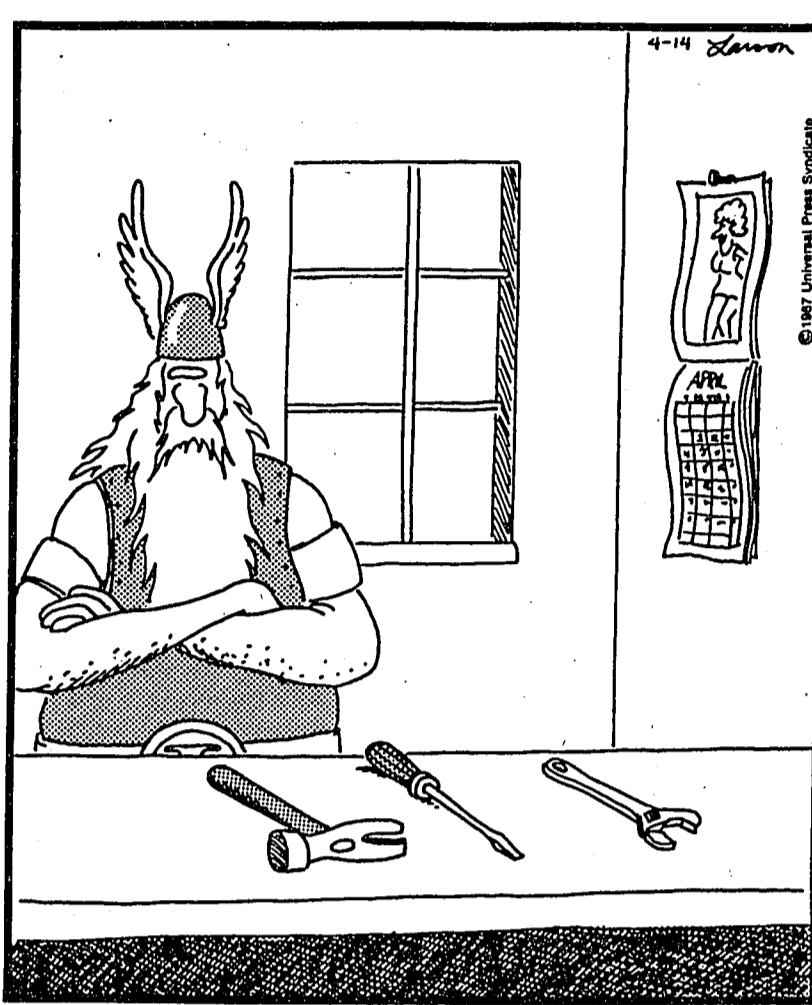
Thor's hammer, screwdriver and crescent wrench