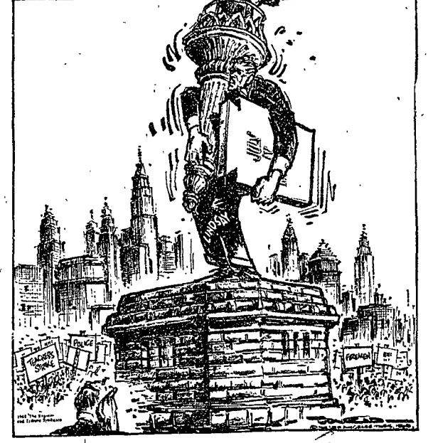
"She called in sick, like everybody else!