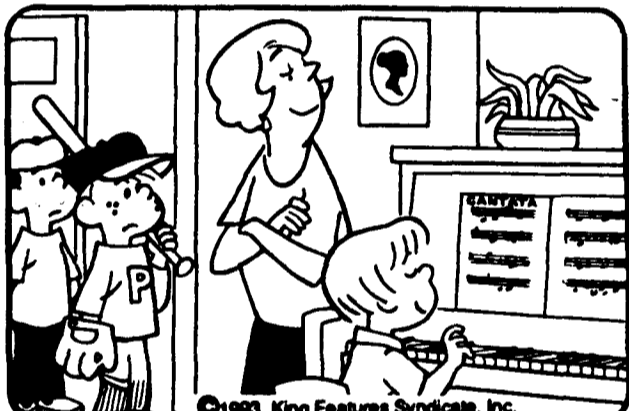
Find at least six differences in details between panels.