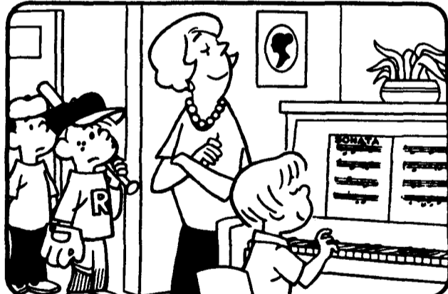
Differences: 1. Bat is shorter; 2. Letter is changed; 3. Beads are added; 4. Title is different; 5. Plant is moved; 6. Silhouette is reversed.