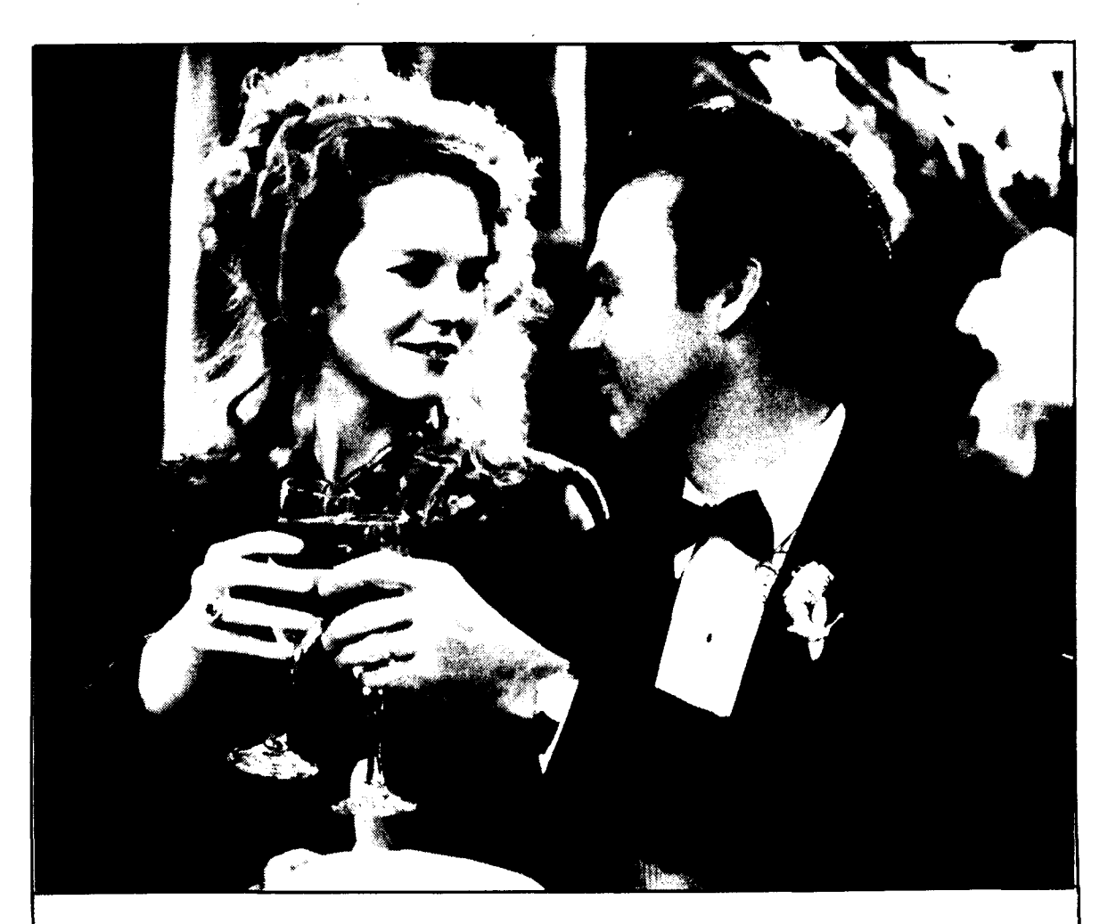
Cheers!: Nicole Kidman and Michael Keaton star in the latest Columbia Pictures' release, "My Life."

I can't really say too much more about the plot of "My Life" without revealing The acting, everything. conematography and the script are all amazing. I can't make you go see this movie, if I could I would. I can only simply say that you should, and I strongly