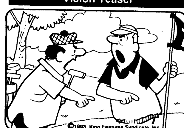
©1993 King Features Syndicate, Inc Find at least six differences in details between panels