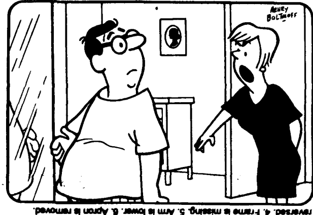
Officences: 1. Head is turned. 2. Glesses are added. 3. Sifnouelte reversed. 4. Frame is missing. 5. Arm is lower. 6. Apron is removed.