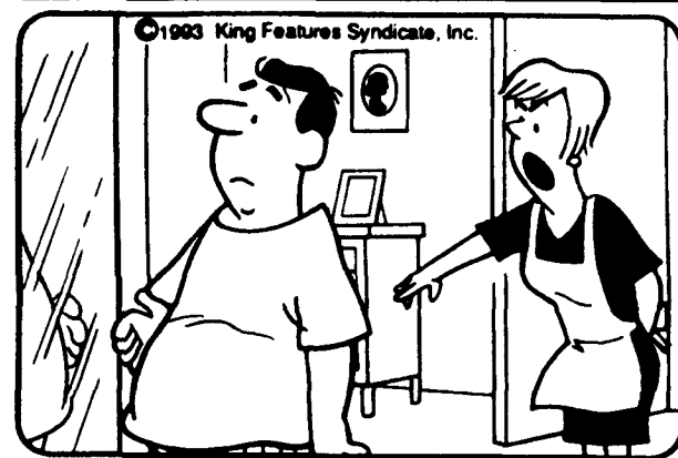
Find at least six differences in details between panels.