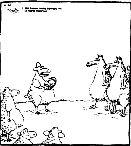
"Well, I suppose you guys can play. But this is just a friendly game of touch, OK? We don't want anyone getting hauled down and devoured."