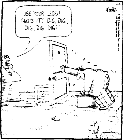
Door-to-door sales drills