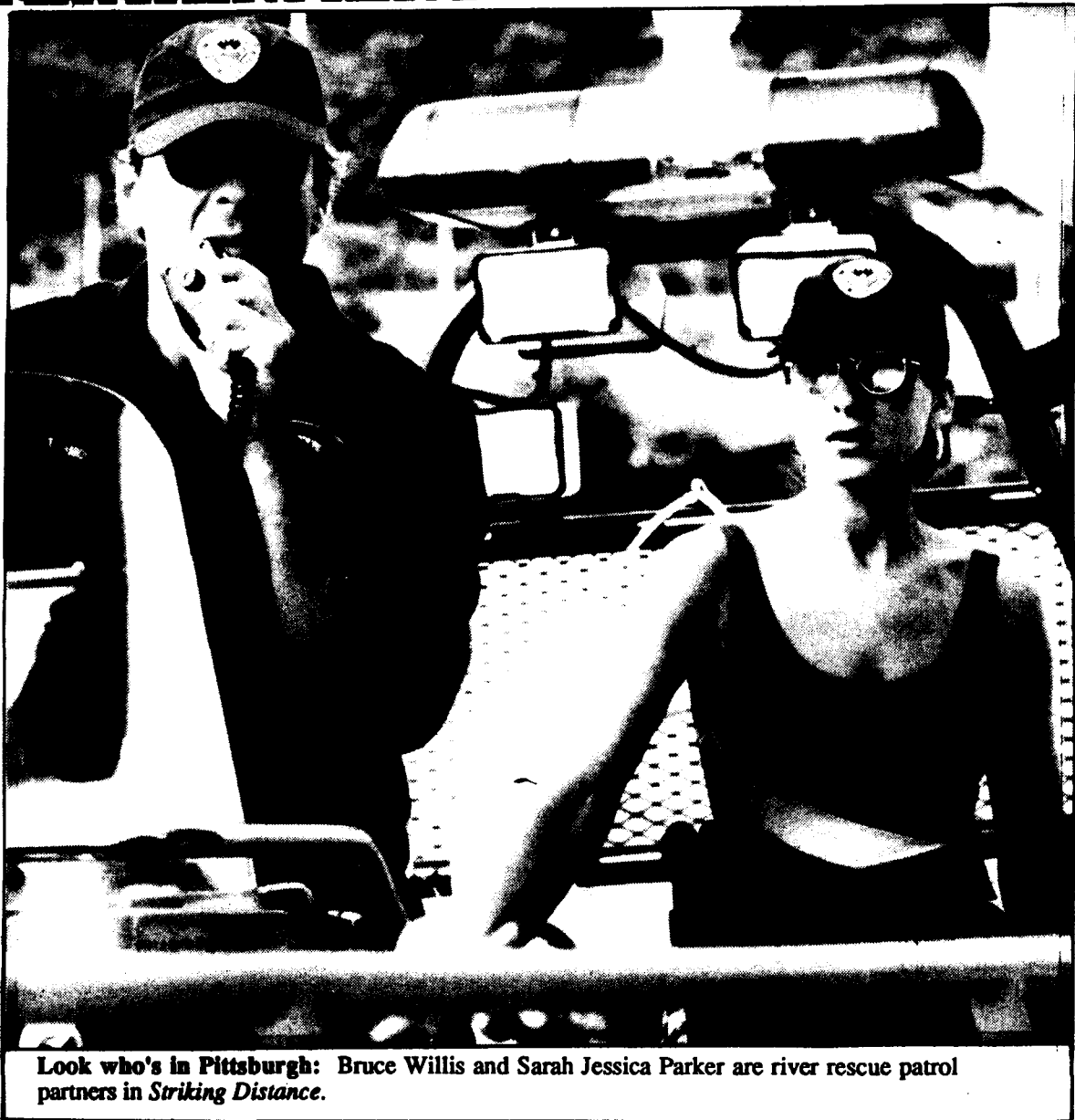
Look who's in Pittsburgh: Bruce Willis and Sarah Jessica Parker are river rescue patrol partners in Striking Distance .

I hope that Striking Distance is the beginning of a well-deserved comeback for Bruce Willis. After Hudson Hawk , he's going to need all the help he can get.