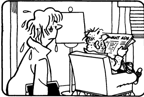
4. Title is different. 5. Can is added. 6. Window is wider. 1. Scarf is removed. 2. Lamp is lower. 3. Picture is missing.