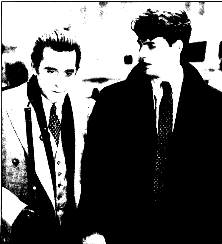
Pacino and O'Donnell star in Scent of a Woman

Pacino is regarded as one of the best actors of the last decade.