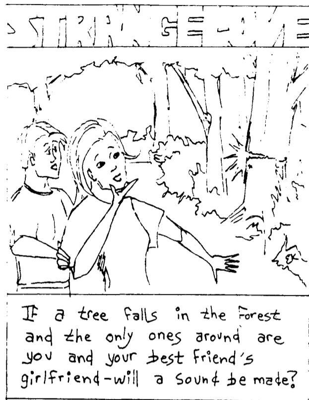
Rubes® By Leigh Rubin