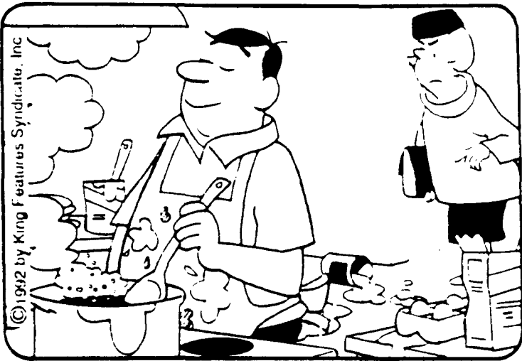
Find at least six differences in details between panels.