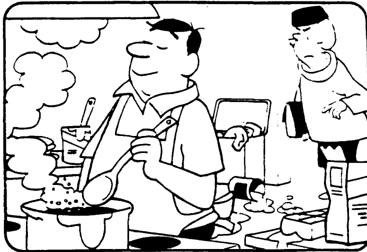
Differences: 1. Range hood is wider. 2. Spots are removed. 3. Spoon is raised. 4. Eggs are missing. 5. Box is larger. 6. Fall is added.