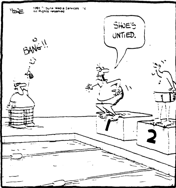
A common, but effective, trick in olympic swimming competition.