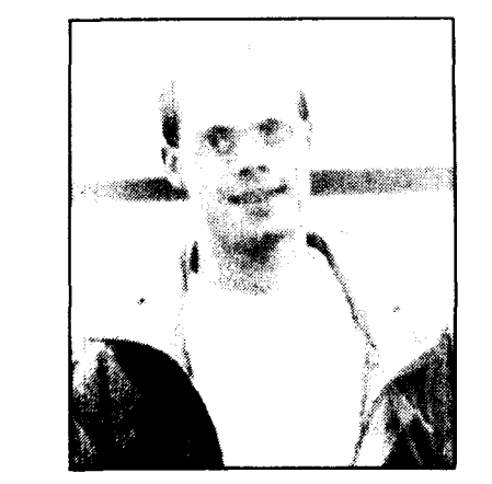
"The Collegian should primarily deal with Behrend athletics but it should also put professional sports standings in the paper for those who don't have a T.V. or get the Times News."