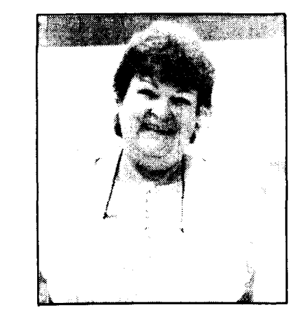
"They need to add more interesting and informative articles, especially material from the students. Maybe try writing something about the stock market or the economy."