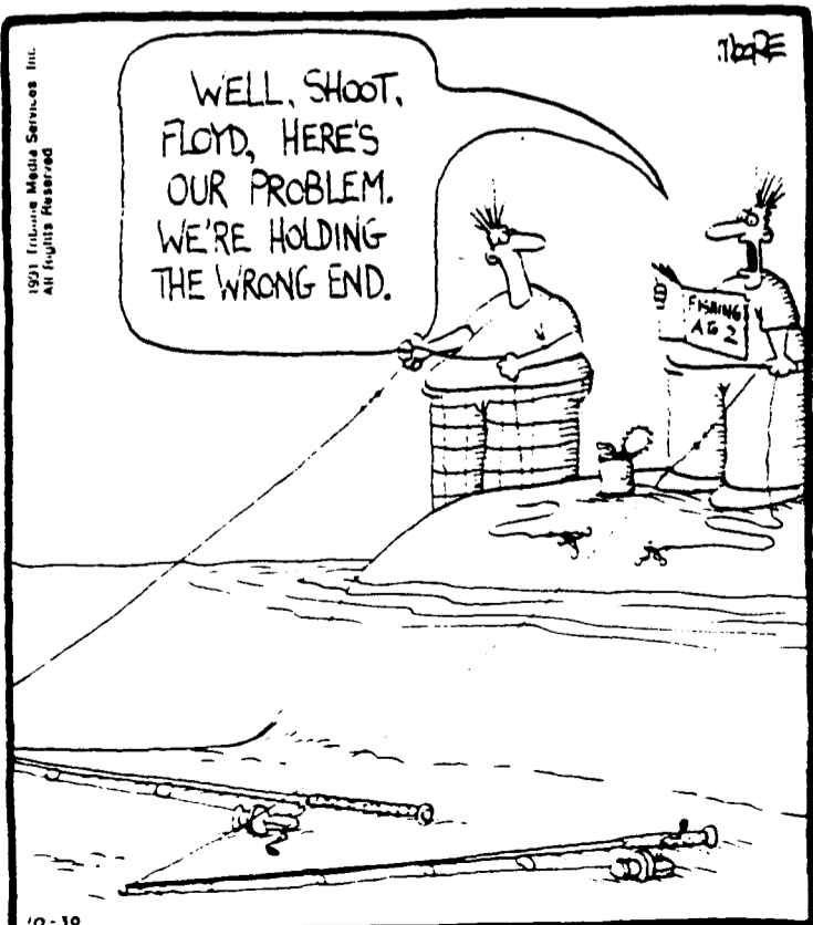
The Bonehead Brothers go fishing