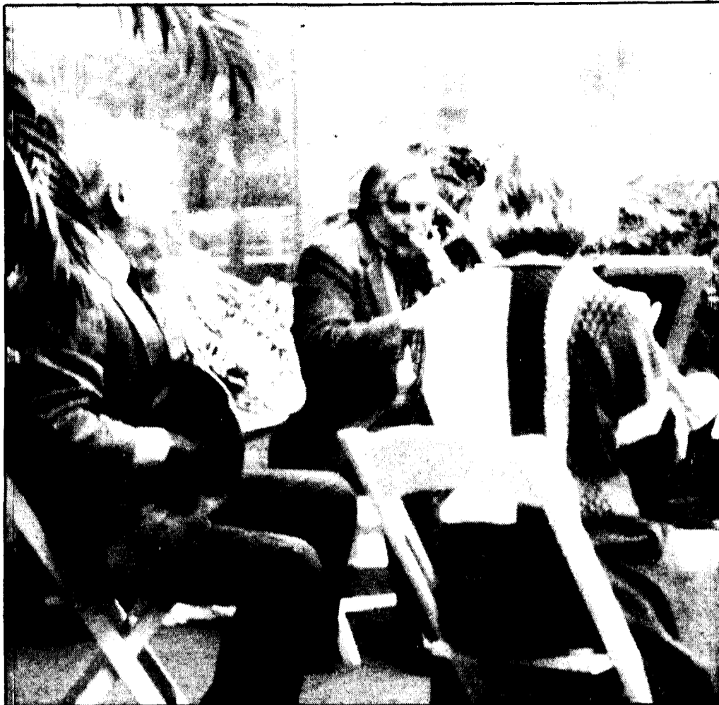
Concert at Noon: Members of the Eastman Brass Ensemble closed out the final performance of this semester's Logan Wintergarden Series on Monday.

GRADUATING IN JANUARY? Before leaving for the holidays