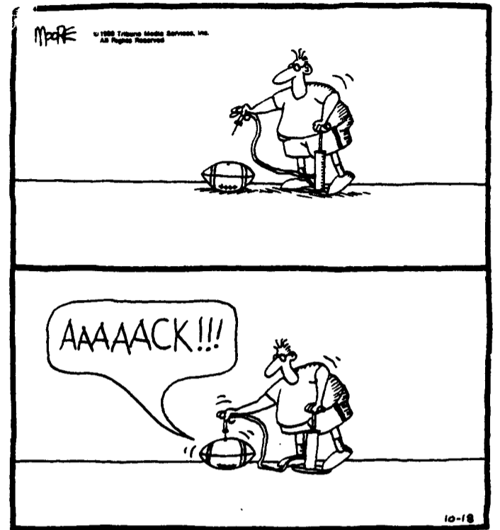
Louie forgets to moisten the needle before inserting.