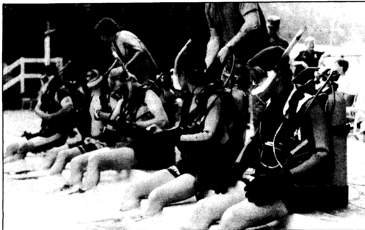
Diver down: members of Behren's SCUBA Club get ready to dive during NAOUI and PADI certification testing classes last week. Club members spent most of last week sharpening their underwater and snorkeling skills.