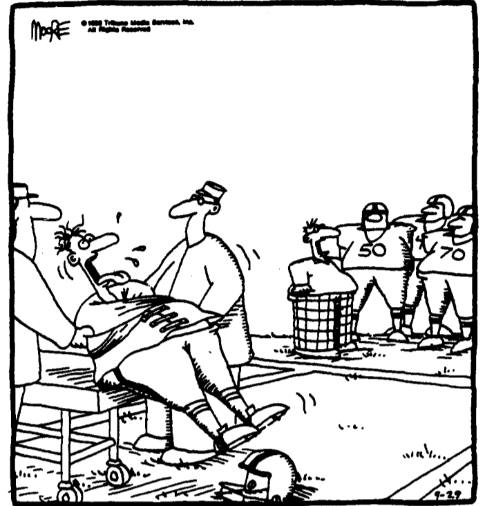
"Well, let this be a lesson to the rest of you about the importance of being mentally prepared for this game."