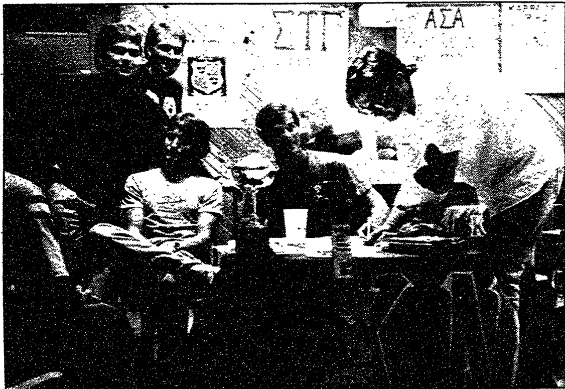
Behrend fraternities: Zeta Beta Tau could be joining the ranks of Behrend fraternities if approved by the Student Government Association