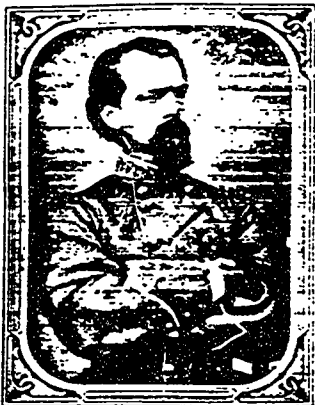
John Brown Gordon

A biography of Gordon that analyzes all areas of his confederate career. Read about his contributions to Georgia, to the South, and to the United States during the Civil War.