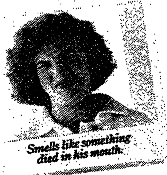
Smells like something died in his mouth.