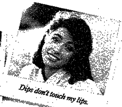
Dips don't touch my lips.