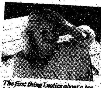
The first thing I notice about a boy is his smile. Ever see a dip's smile?

DIPPING IS FOR DIPS. DON'T USE SNUFF OR CHEWING TOBACCO.