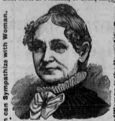
Woman can sympathize with Woman. Health of Woman is the Hope of the Race.