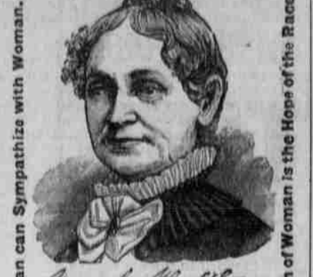
Woman can sympathize with woman. Health of woman is the hope of the race.