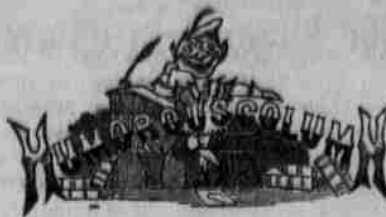
A Boy's Composition on Woodchucks.

A wag proposes to publish a newspaper to be called the Comet, with an original tale every week.