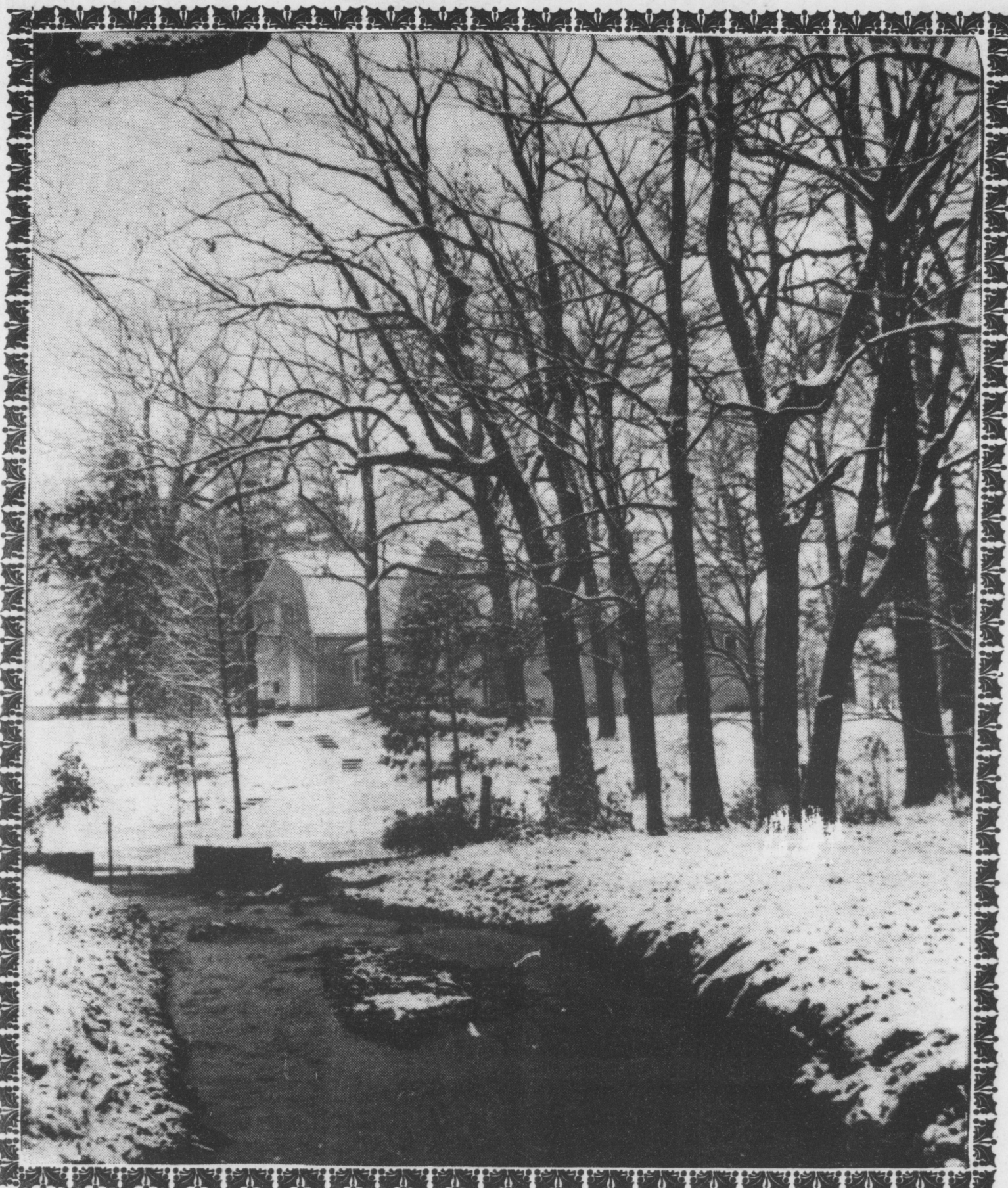
Donegal Springs