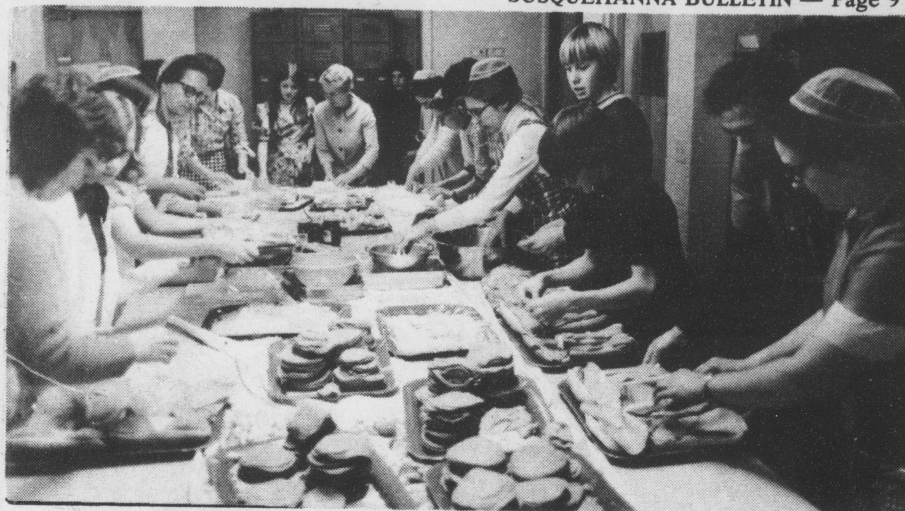
Parents and 9th graders assemble hoagies to raise money for Kraybill School.