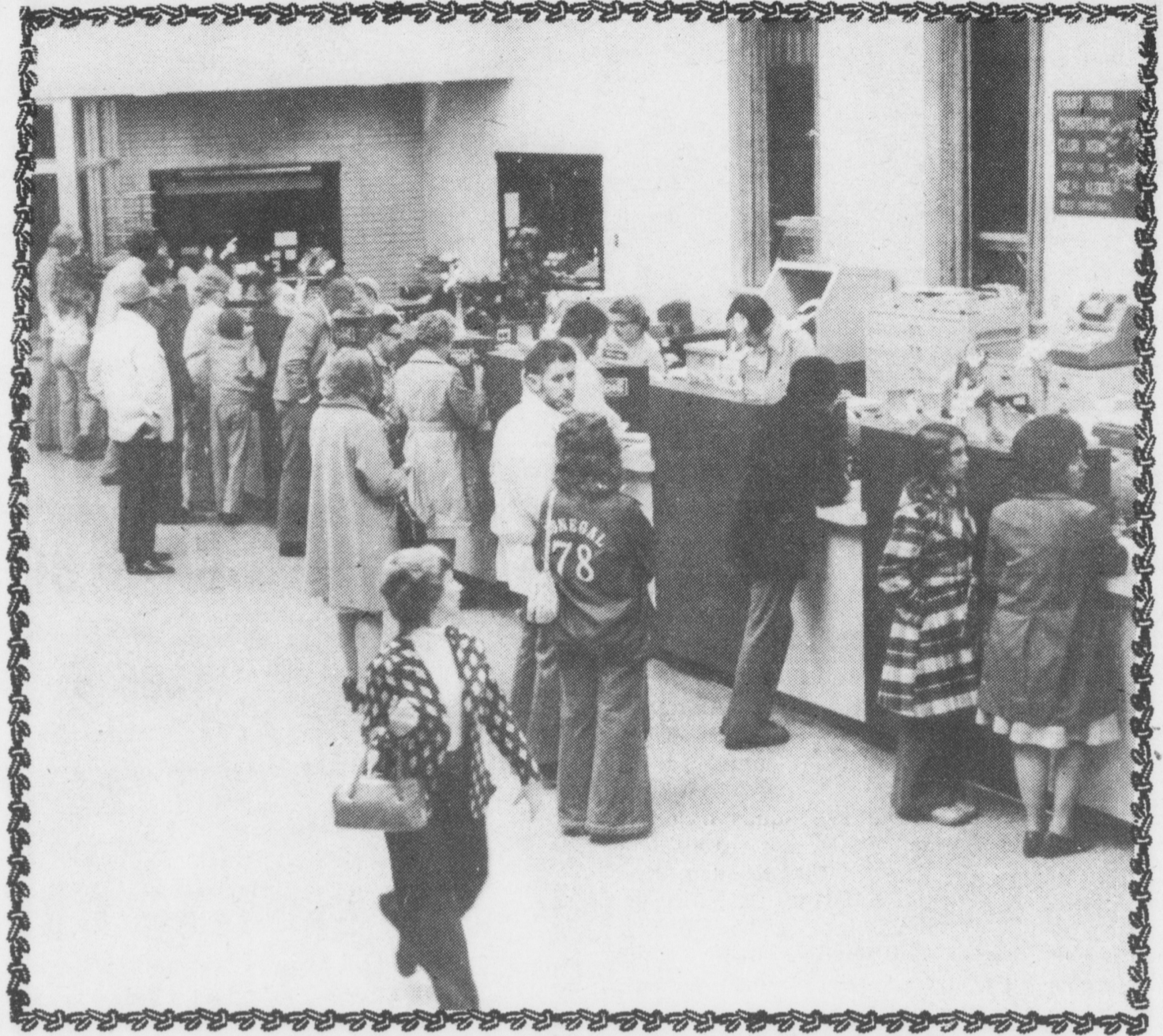
This photo was taken at the Union National Bank in Mount Joy on Friday evening, October 31, the first day for cashing Christmas Club checks.