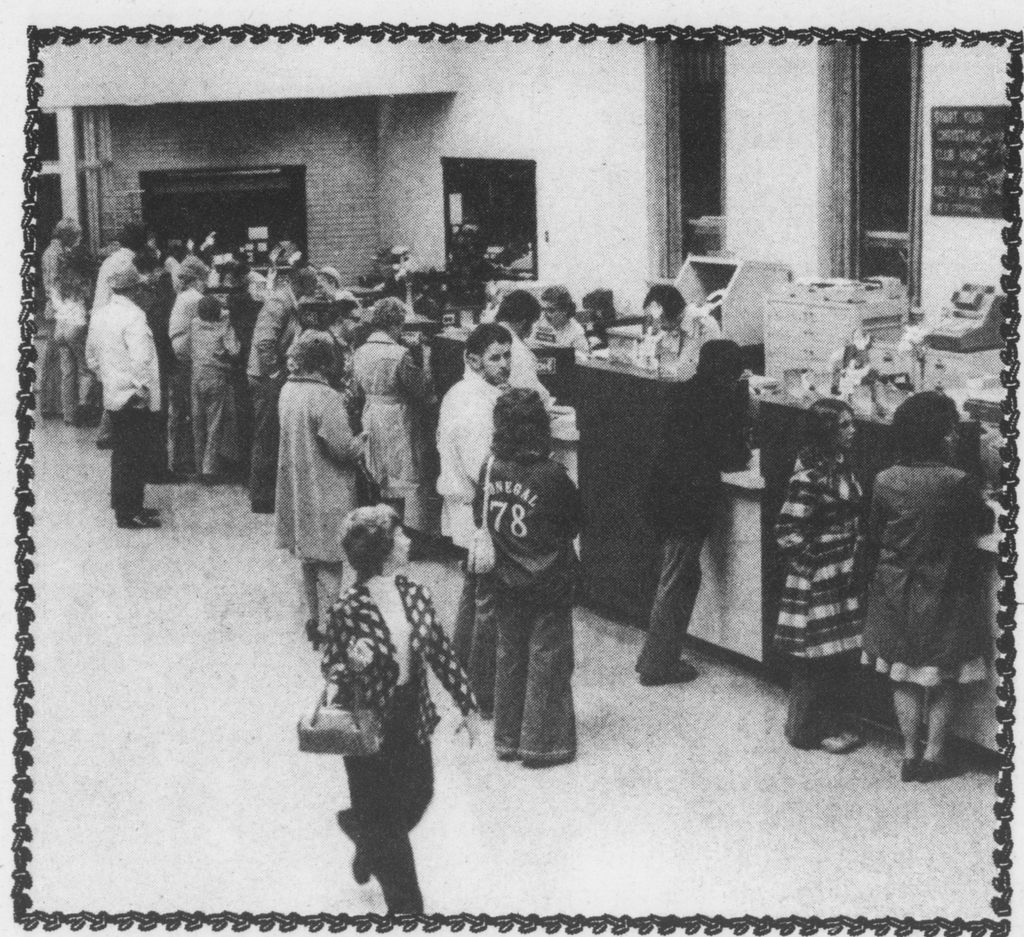
This photo was taken at the Union National Bank in Mount Joy on Friday evening, October 31, the first day for cashing Christmas Club checks.

concerts, recital, oratorio and opera in various parts of the United States. For many years, he was a member of the music staff at Muhlenberg College, where he also directed the opera workshop. He is now on the faculty of Cedar Crest College. During the last twenty-two years he has produced a total of forty different operas in Lancaster, Allentown, Camp Beaverbrook, and Wilmington, Delaware.