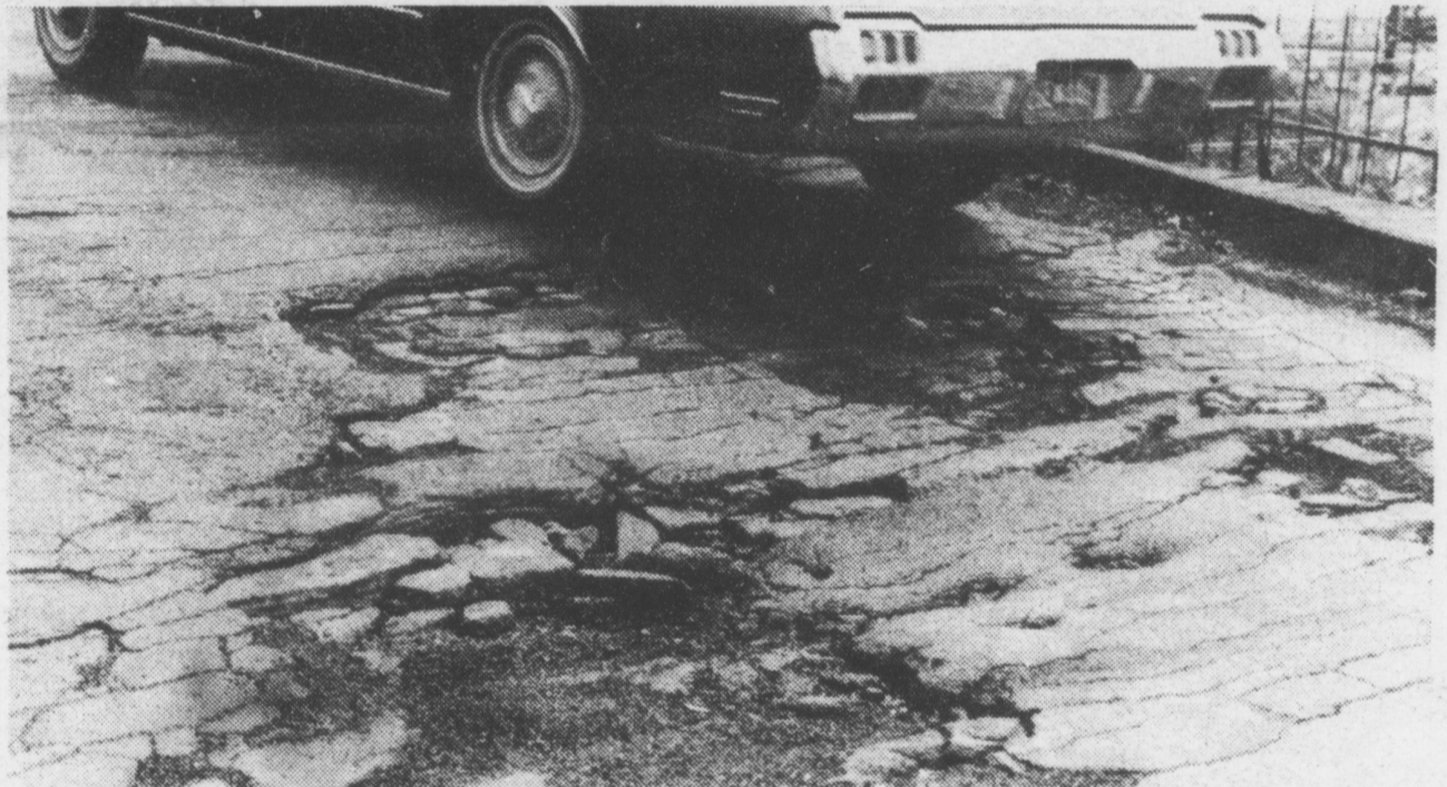
Mount Joy railroad bridges are in bad shape.

Penn Central Railroad today is unwilling and possibly financially unable to live up to its original agreement with the borough.