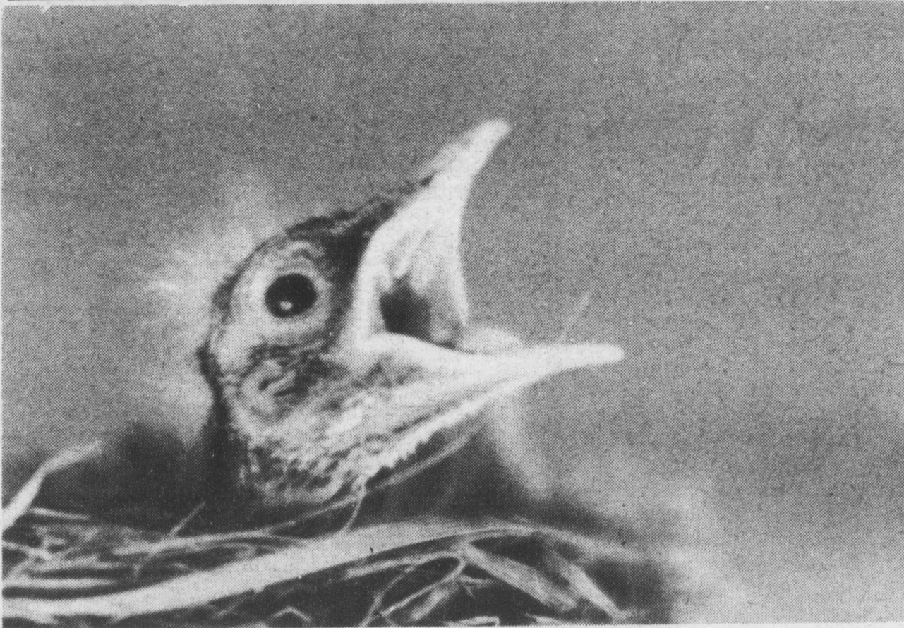
The prize picture.