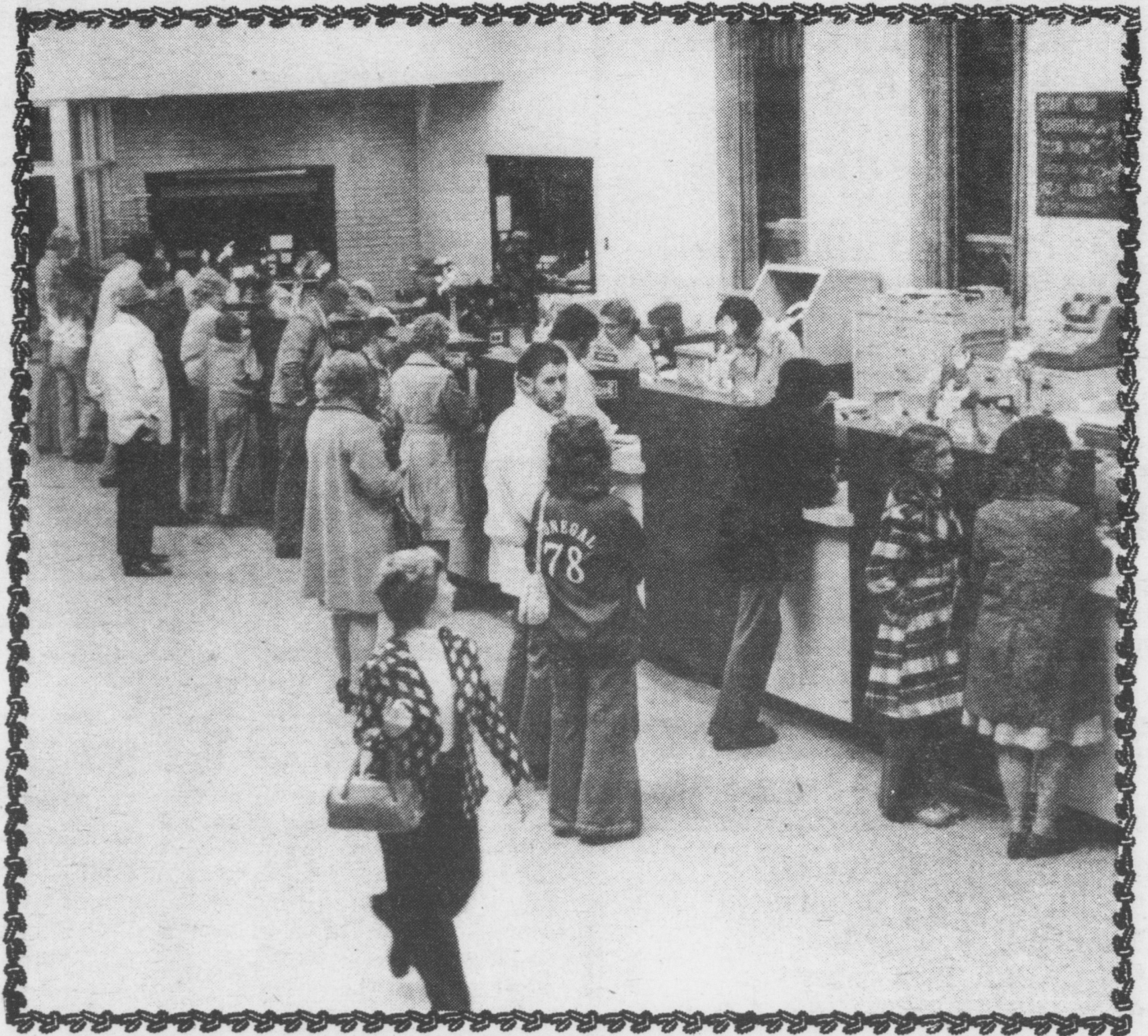
This photo was taken at the Union National Bank in Mount Joy on Friday evening, October 31, the first day for cashing Christmas Club checks.