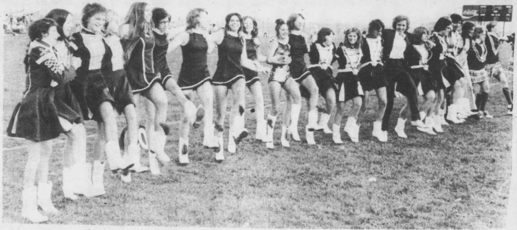
Indians' first TD cheered everybody up.