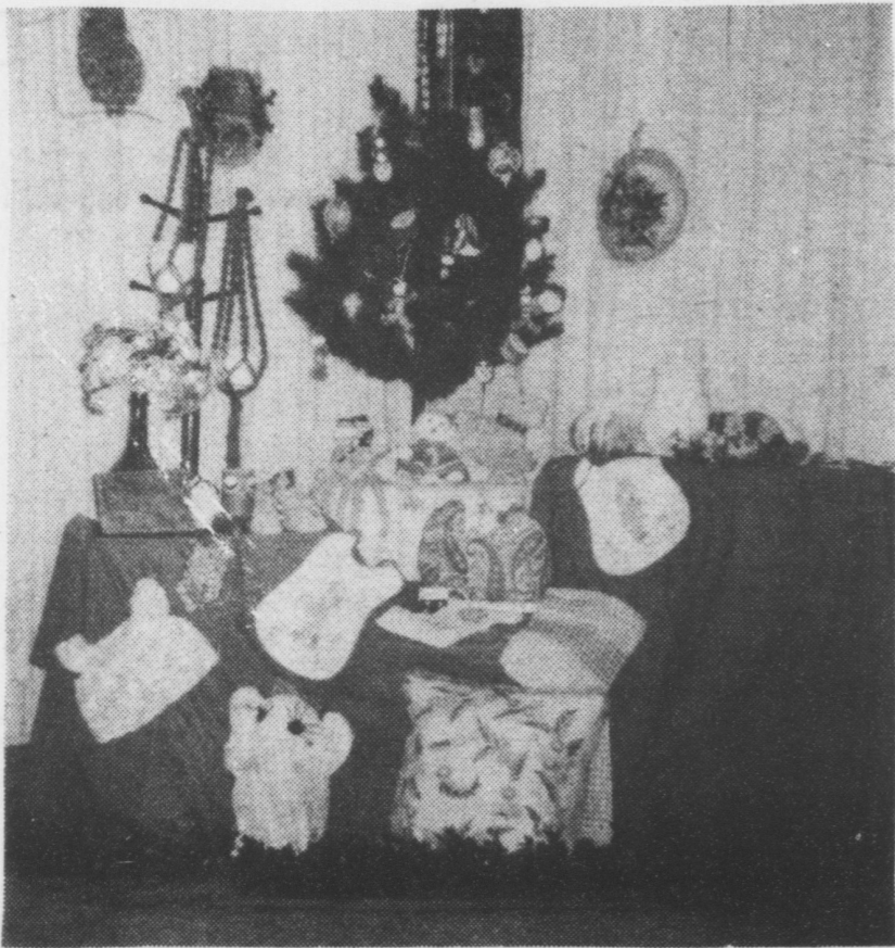
Examples of Welcome Wagon craftsmanship