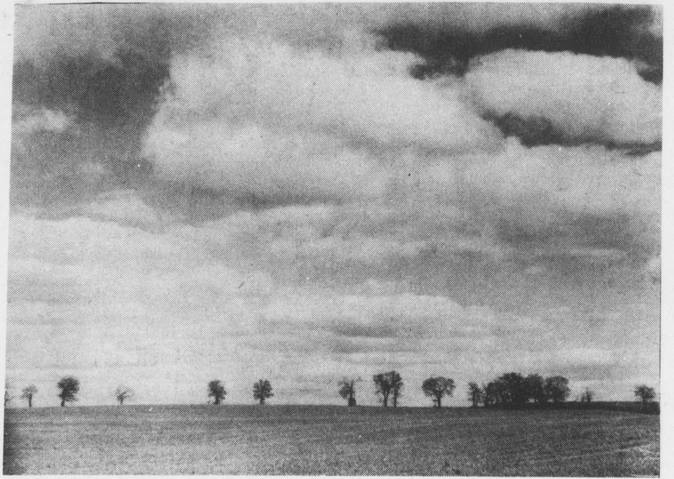
Bare fields along Donegal Springs Road last week.