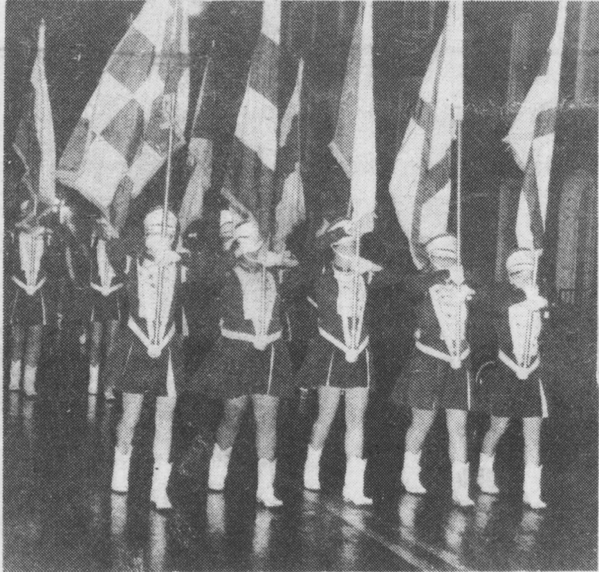
The color guard passes