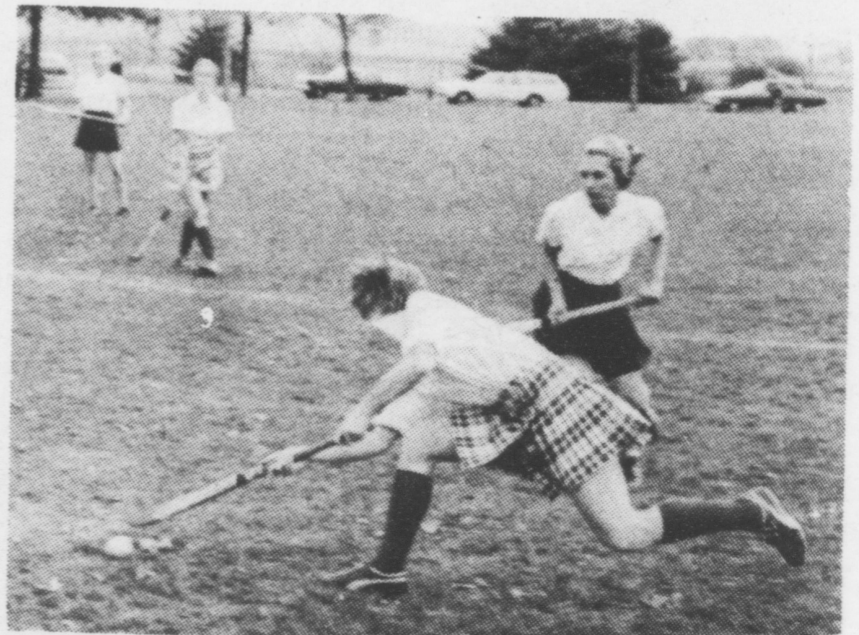
Rampaging Indian keeps control of the ball while running flat-out.