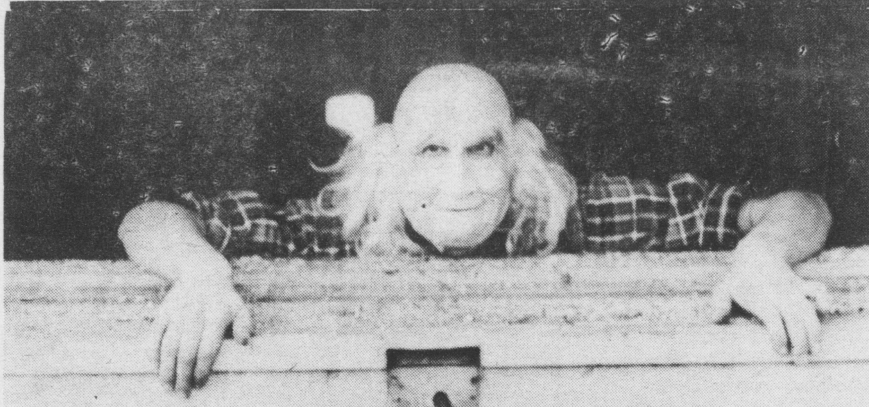
Odd-looking gentleman was seen peering from the window of Jaycee center