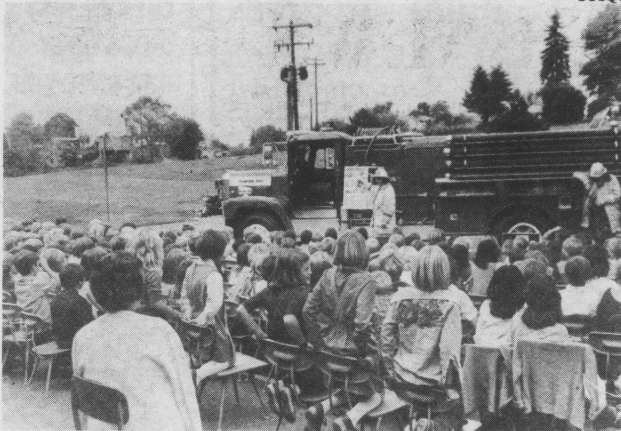
Florin firemen spoke at Kraybill Mennonite and Grandview Schools.