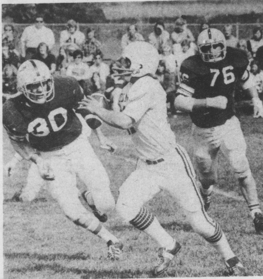
Donegal tried to pass 6 times too often.