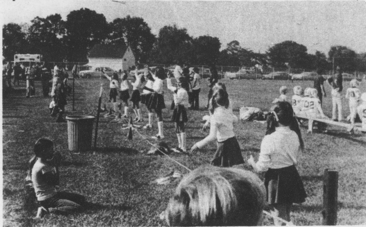
Cheerleaders for Donegal Braves