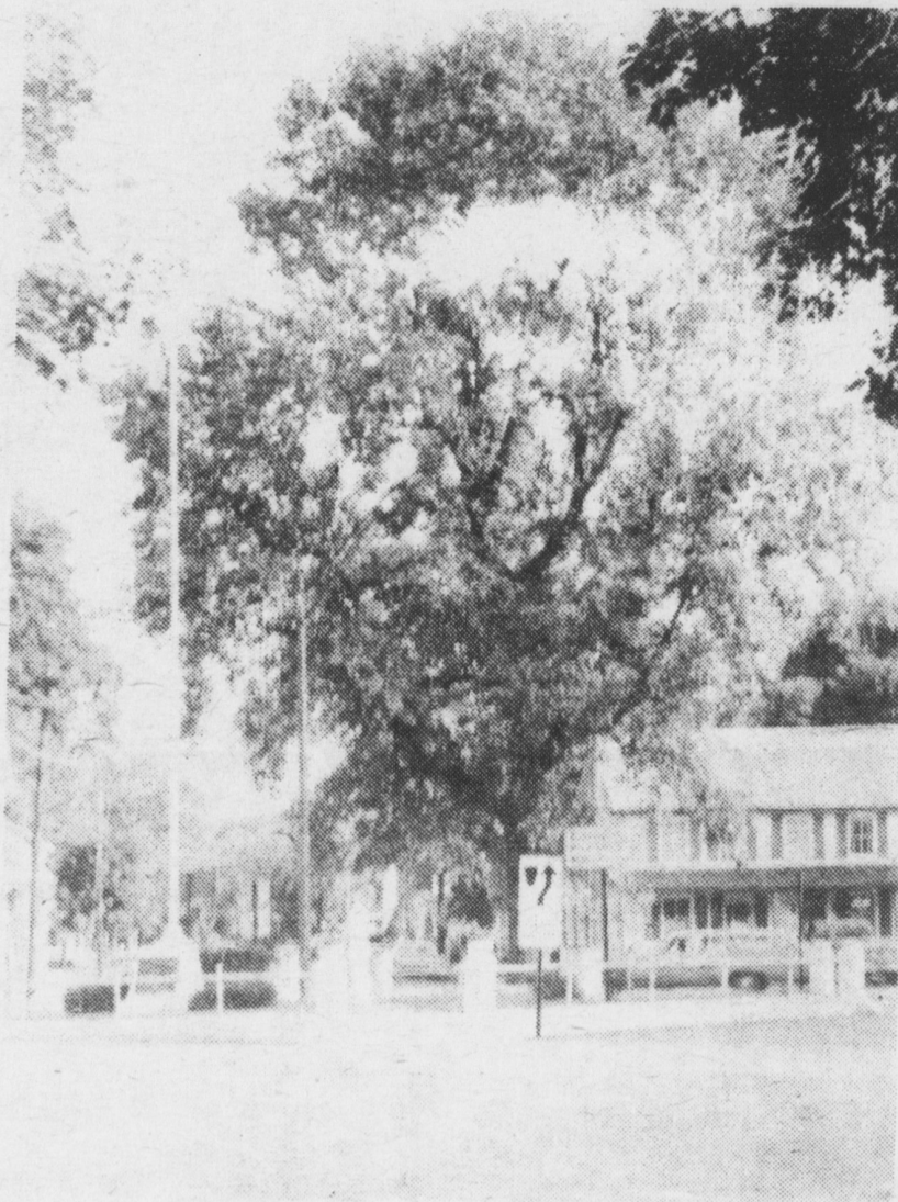
Tulip tree in Maytown Square planted by Simon Cameron