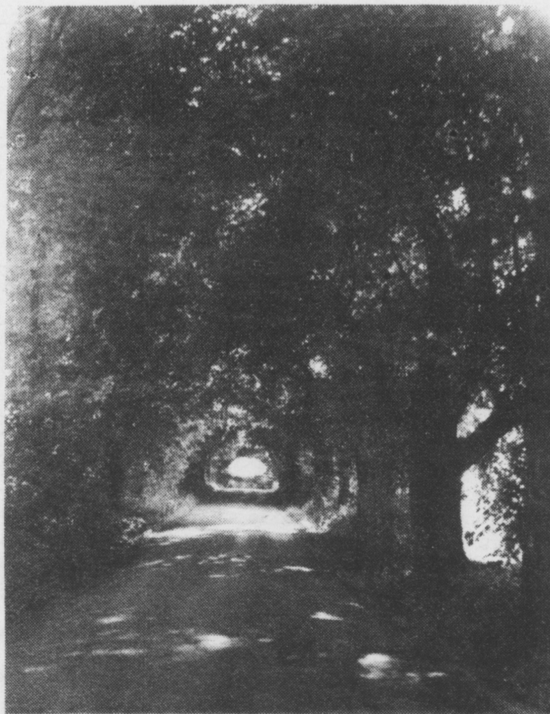
The "tunnel" of maple trees along Donegal Springs Road planted by Simon Cameron

It seems that the best historical research has turned up nothing to refute Cameron's statement near the end of his 90 years on earth: "When I am gone all I ask is that people may say that I did the best I could and was never untrue to a friend."