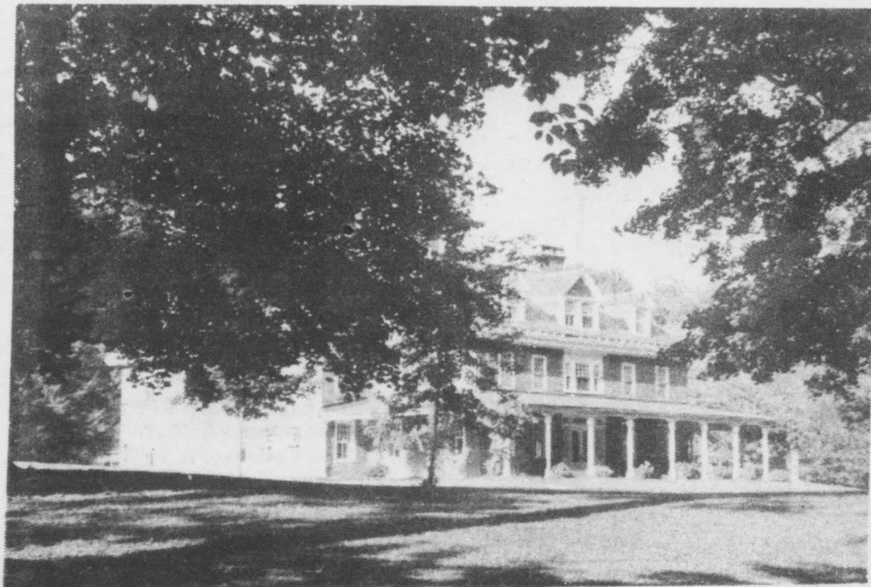
Cameron's mansion near Donegal Church