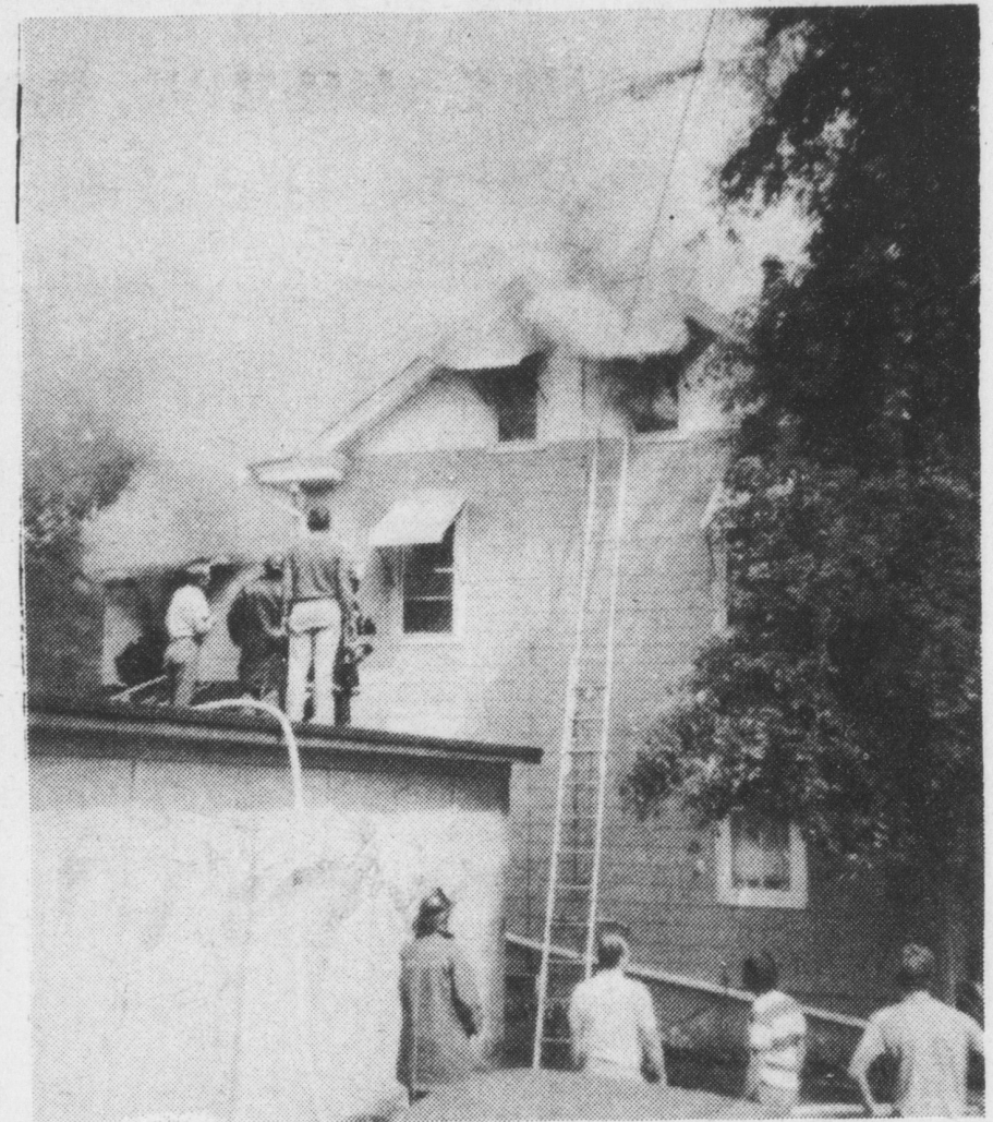
Friendship firemen battle blaze on Henry Street

Trophies will be awarded to the winner and runner-up to the winner and runner-up of each group. The trophies are sponsored by Kenny Smith Sport Shop.