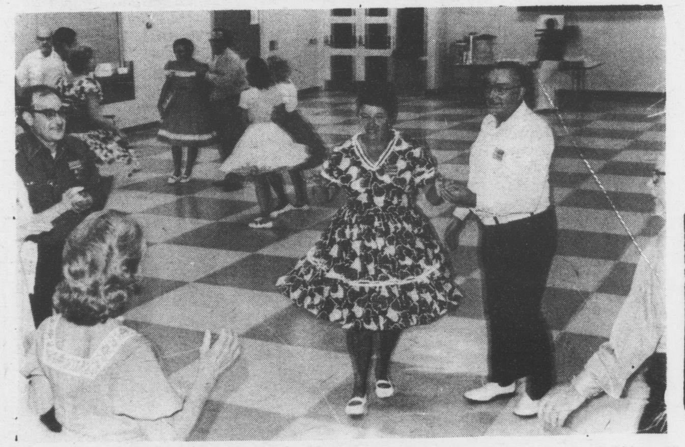
Stepping out at Vo-Tech last week