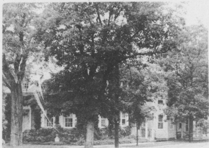
The Haines house in Maytown square