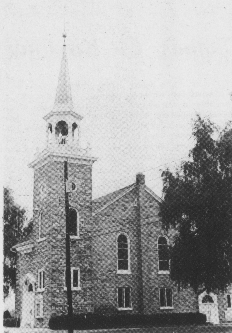
St. John's Lutheran church, Maytown