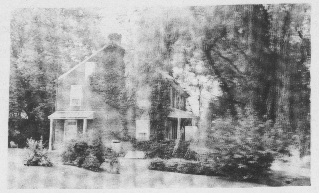
House at Manheim and Barbara Streets, being considered for museum for Mount Joy Area Historical Society