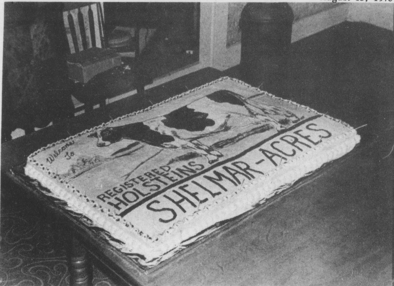
A cake masterpiece by Lee Bickford for Holstein Field Day