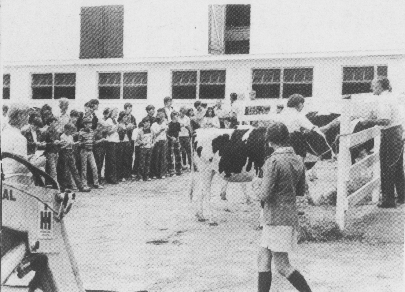
Everyone's a judge of Holsteins