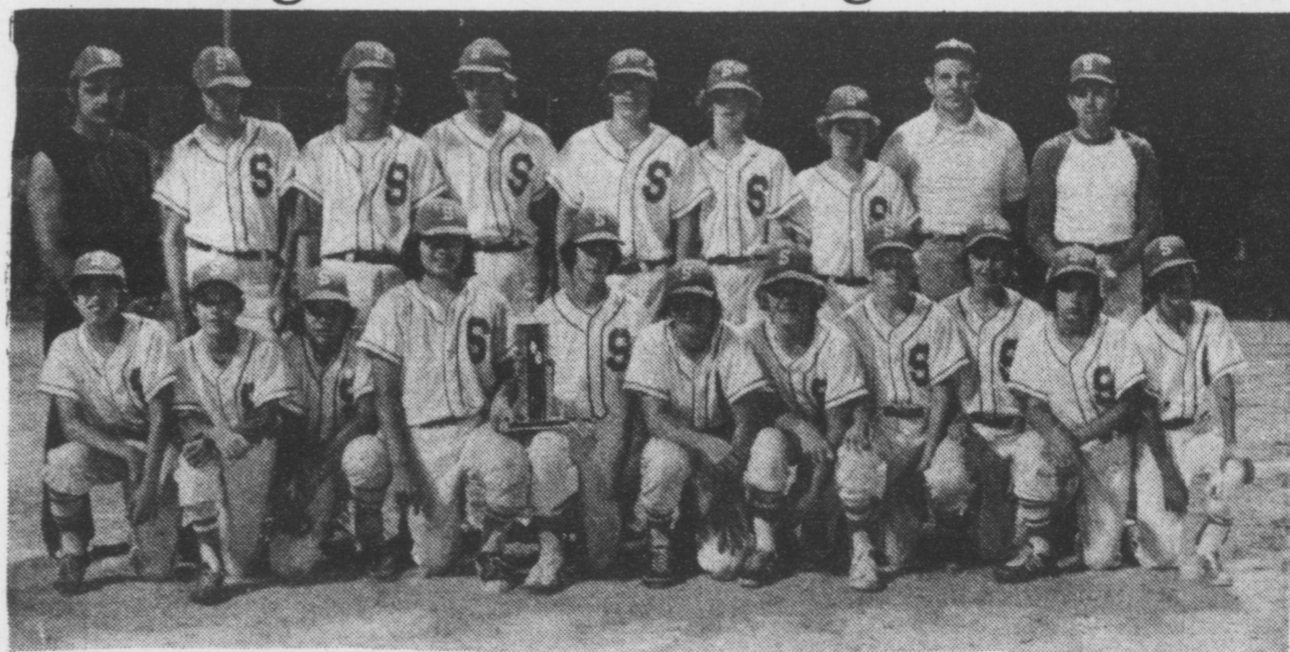
Strasburg team that beat Paradise in Junior Midget finals at Mount Joy last Wed. nite