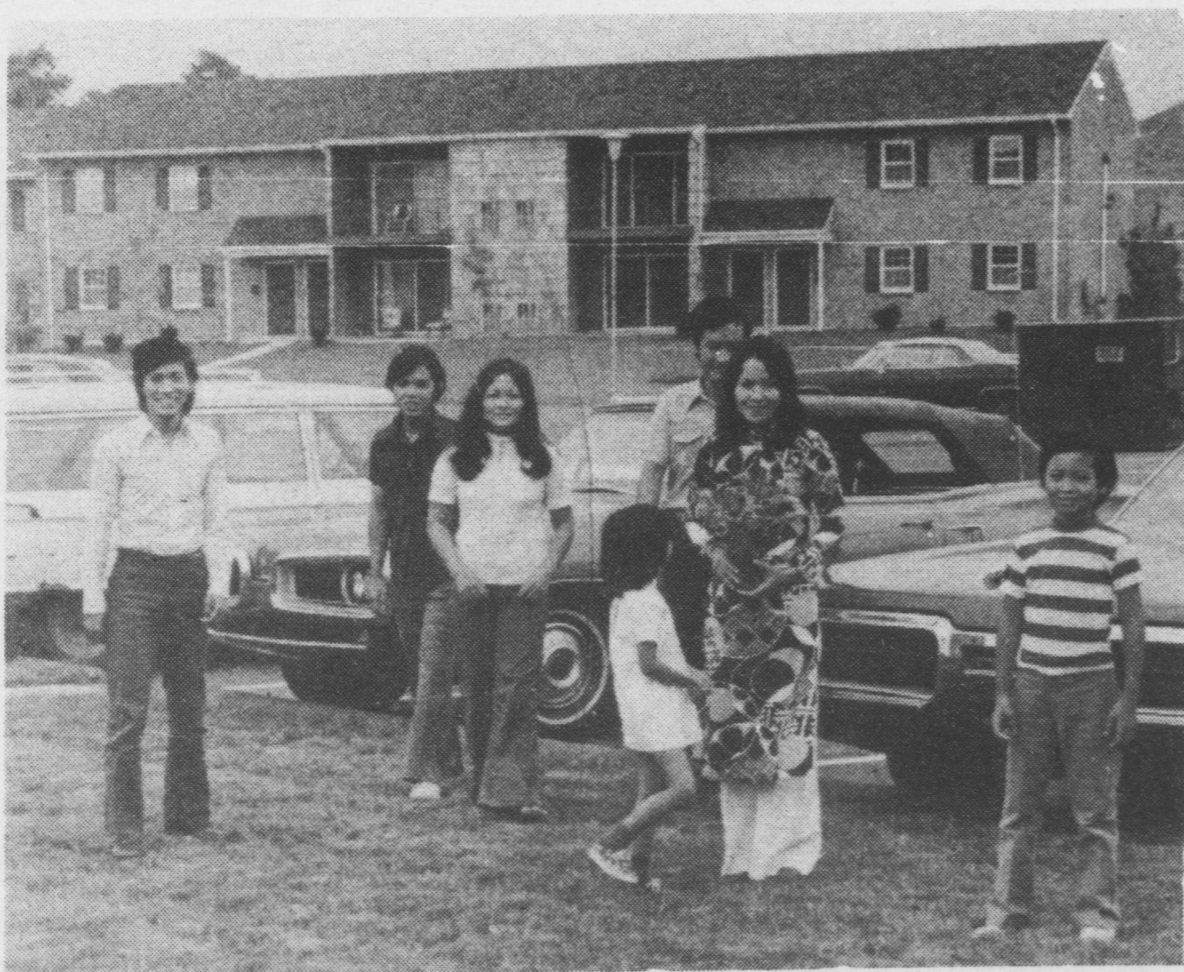
Just arrived at their new home in Mount Joy