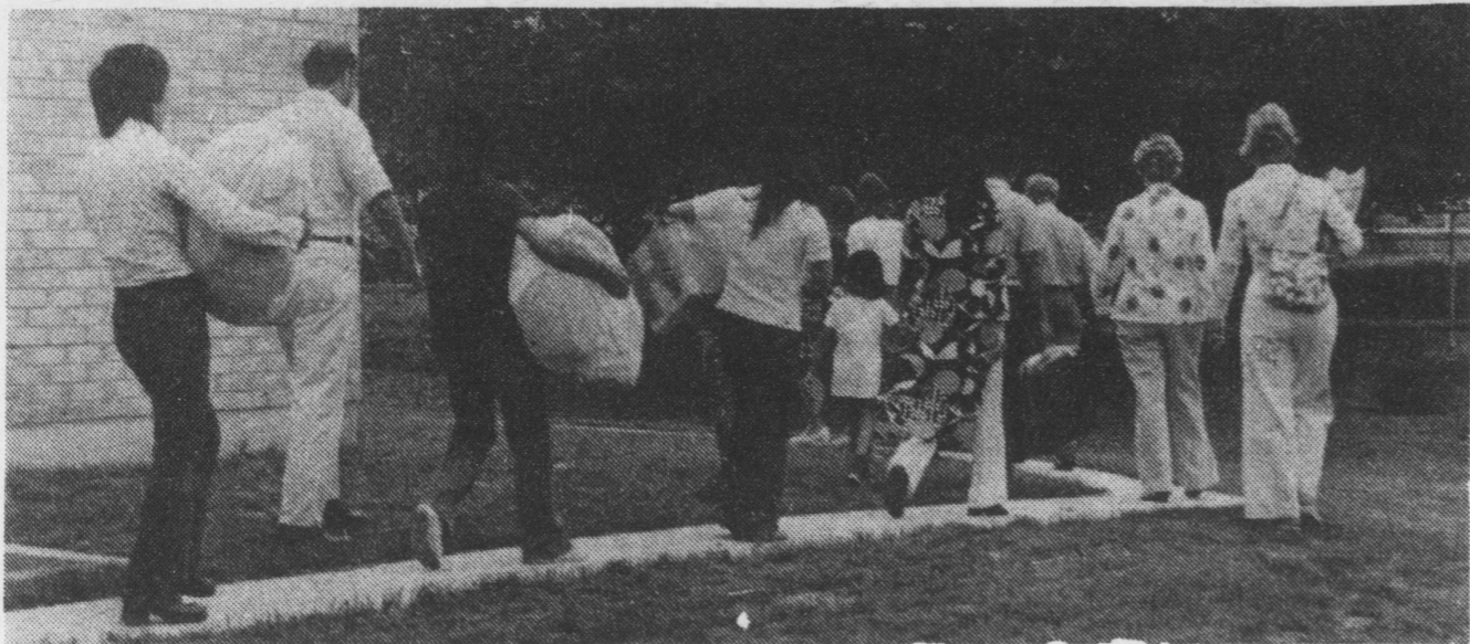
Carrying their belongings into their new home