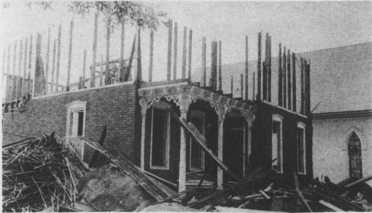
The half torn down old parsonage of the Evangelical Congregational Church on New Haven Street in Mount Joy.