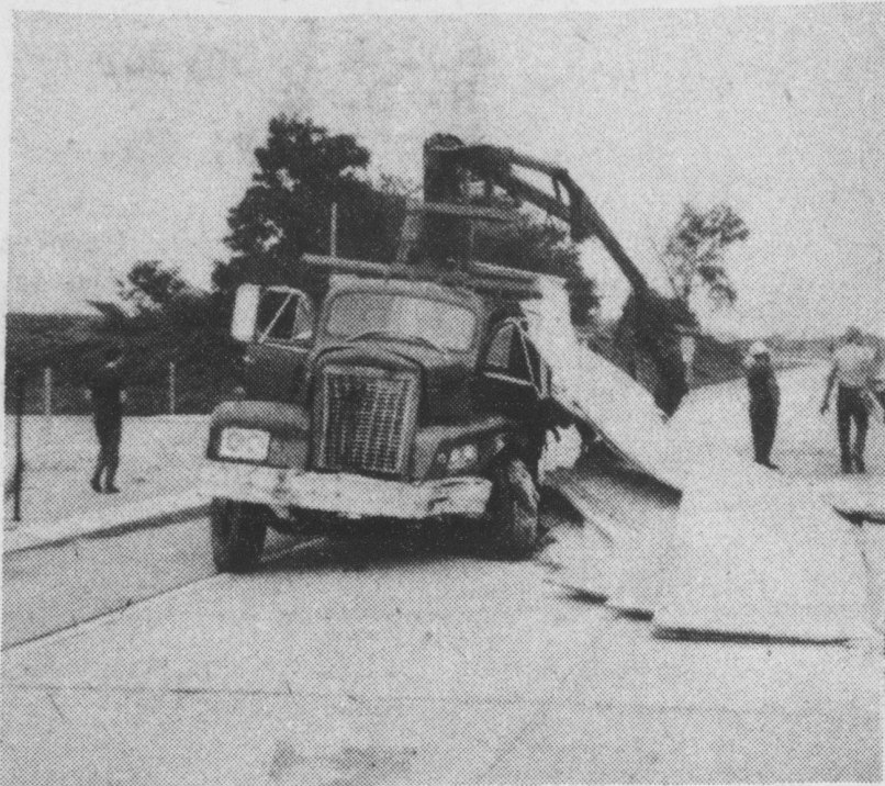
One of trucks involved in accident on Route 230 and Esbenshade Road

The school board also voted to continue health and accident insurance for teachers until August 31.