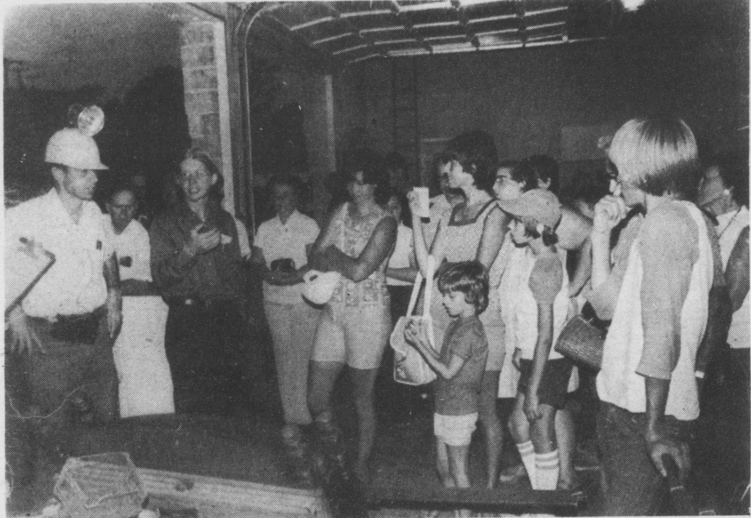
Maytown Reformed Church auction last Thursday night at Maytown Fire Company